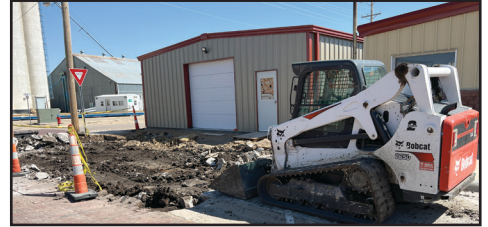
West side of new addition.

The new building to the North and East of the AAA museum is almost completed. We hope to have some items in place to start our 2023 season which runs June 1 through September 1, 2023. The AAA museum will be staffed Thursday - Saturday 1-4pm.