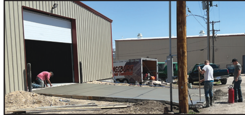
South side entrance for large equipment.